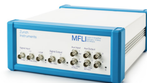
MFLI lock-in amplifier from Zurich Instruments