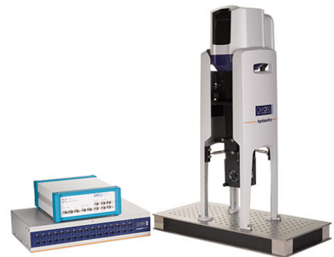
Figure 1. SampleProtect measurement system set-up including OptistatDry cryostat, MFLI Lock-in Amplifier and an ESD break-out box – used for this application.

The OptistatDry was set-up with the MFLI and a ESD break-out box (see Figure 1). SuperPower 2G YBCO HTS tape, from Furukawa Electric was used as the sample. A 500 mm length of this tape was coiled in a non-inductive loop and mounted to an OptistatDry sample puck using a custom made copper bracket (see Figure 2). The 12 mm wide tape had voltage taps applied 15 mm from each end, giving 470 mm between the voltage taps. Current supply terminals were added at each end of the tape to provide an excitation current through the tape. The sample puck included a CX 1050 SD Cernox™ sensor and a 50 \Omega 25 W surface-mount heater. The room-temperature end-to-end resistance of the current loop (HTS sample plus wiring loom plus cabling) was 149.2 \Omega measured at the break-out box terminals. The OptistatDry heat exchanger also has a CX 1050 SD Cernox™ sensor and a heater. The system, under MercuryITC control, allows for simultaneous sweeps of the heat exchanger and sample puck temperatures at precise user selected rates. To resolve the superconducting transition in the YBCO, temperature sweeps were conducted at 0.1 K/min, 0.05 K/min and 0.01 K/min over the transition region. The MFLI was used, both as a low-distortion function generator and as a Lock-in Amplifier to recover the small demodulated response. Its Scope capability also allowed monitoring of the input signal in real time.