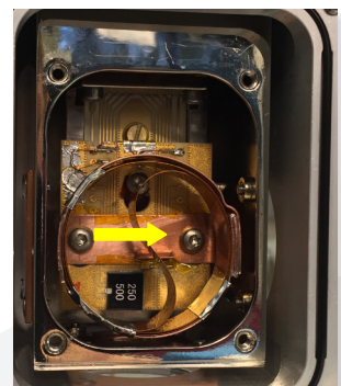
Figure 2. YBCO coil (marked with the arrow) mounted on the sample puck