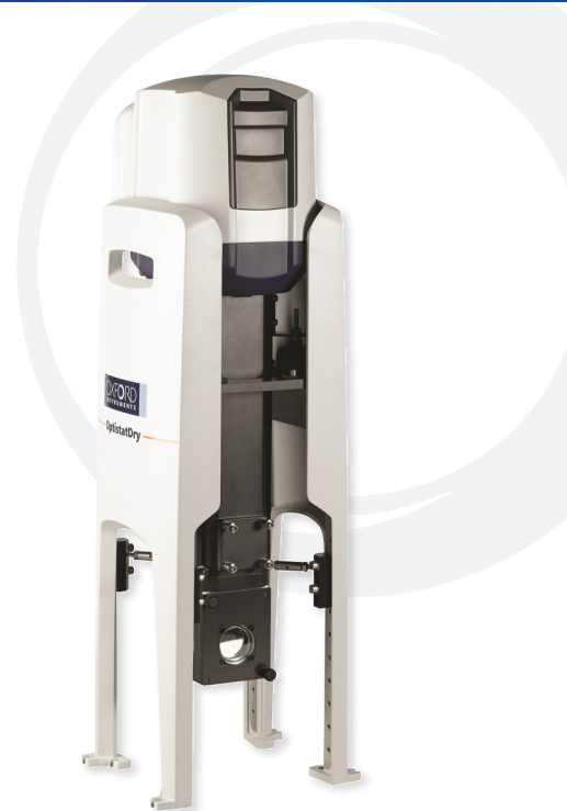
OptistatDry Cryofree cryostat from Oxford Instruments

Zurich Instruments' MFLI uses the latest hardware and software technologies to bring the benefits of high performance digital signal processing to lock-in amplifiers at medium and low frequencies. The MFLI features a differential voltage input as well as a current input, a dual-phase demodulator and a high quality signal generator, covering a frequency range DC to 500 kHz or DC to 5 MHz. With its superior performance and outstanding tool-set, the MFLI defines a new standard for lock-in amplifiers.